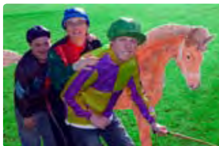
Tutti artists and the Melbourne Cup Luncheon promotion